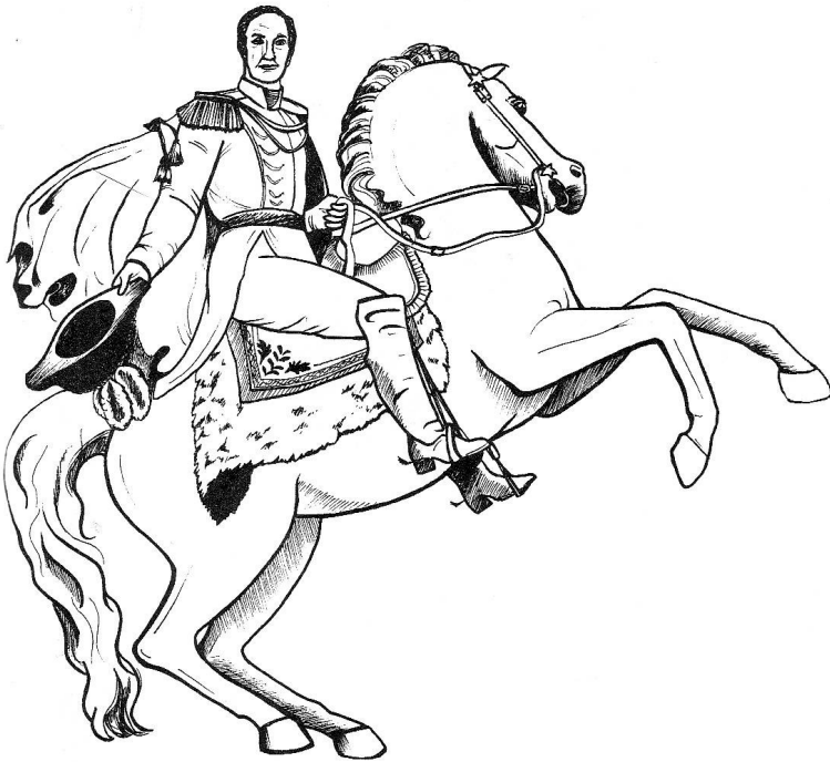
Simon Bolívar was known as “El Libertador”.